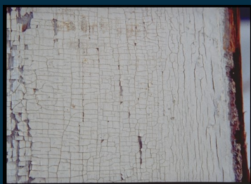
Deteriorated lead-based paint has a "alligator" type cracking